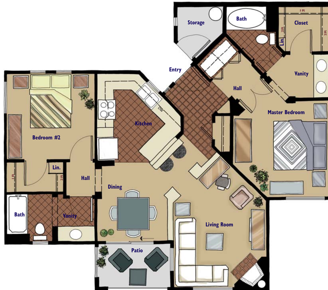
2 bedroom, 2 bath home

This plan is an artist's conception only and is not intended to be an exact representation of the project site. The Pointe reserves the right to change floor plans, specifications, materials and prices without notice. Features and amenities anticipated may, or may not, be offered as options or included in the base price, all options included at additional cost are subject to construction cut-off dates. Ceiling Fans, Fireplaces, Furniture, Upgraded Floor Cover are options. Locations are approximate and are subject to field adjustment. Variations in floor plans and elevations do exist; window designs and configuration of patios/balconies differ by location. A homeowners association for a monthly fee provides maintenance of all common areas. All maps, plans, landscaping and elevation renderings are the artist's conception and are not to scale, details will vary. Square footage is approximate only. All plans are "PRELIMINARY" until approved by regulatory authorities.